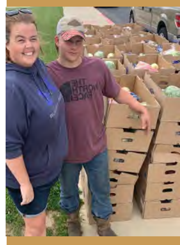
Volunteers readying a food giveaway at Yale Elementary School

Huron, Lapeer, St. Clair, Sanilac and Tuscola Counties